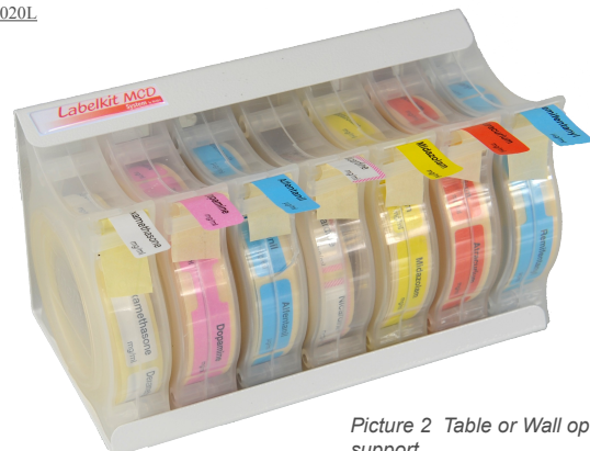
Picture 2 Table or Wall optional support

We can make customized labels for orders of at least 10 pcs per each new type. We update our labels regularly following our customers' request.