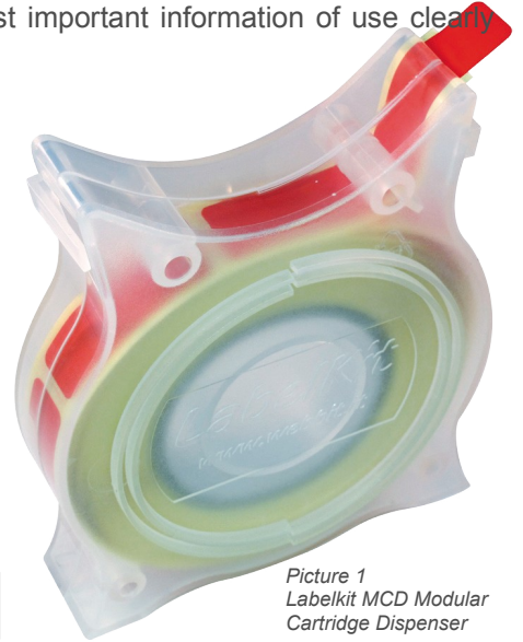
Picture 1 Labelkit MCD Modular Cartridge Dispenser