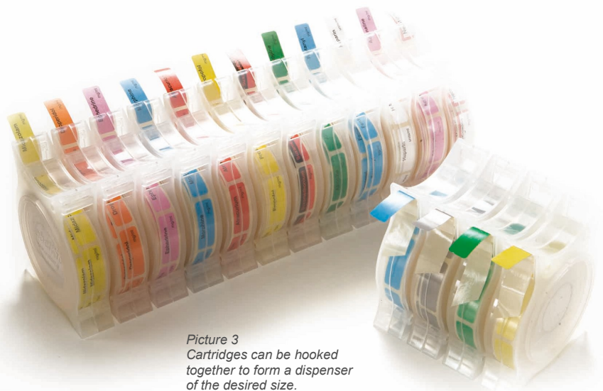
Picture 3 Cartridges can be hooked together to form a dispenser of the desired size.

We can make customized labels for orders of at least 10 pcs per each new type. We update our labels regularly following our customers' request.